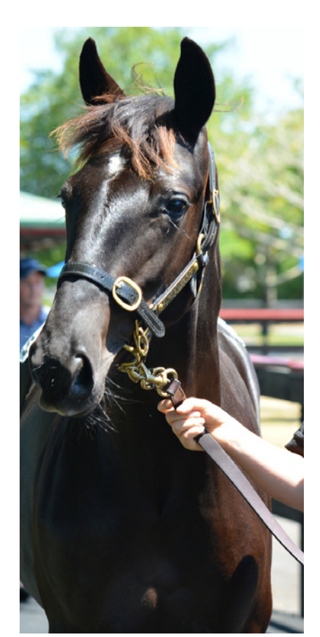
LOT 75 | MEETMEINSORRENTO Bettor's Delight - Pocket Matao