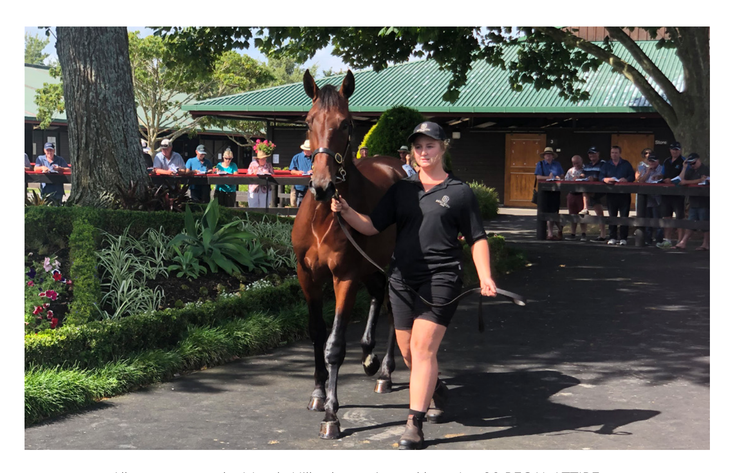
All eyes were on the Muscle Hill colts - pictured here, Lot 80 REGAL ATTIRE.