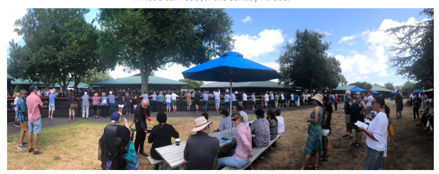
What a turn out for the Sunday Parade!